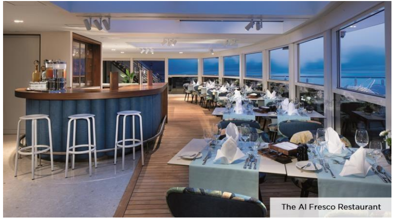
The AI Fresco Restaurant