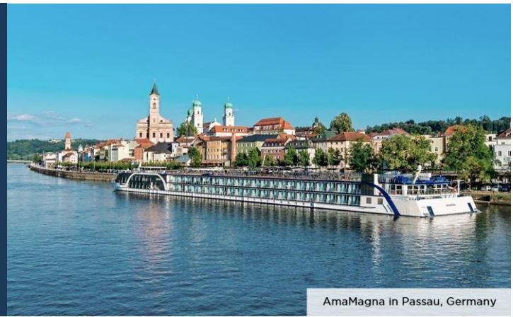
AmaMagna in Passau, Germany

7-night cruise from Budapest to Vilshofen October 5-12, 2025 | AmaMagna